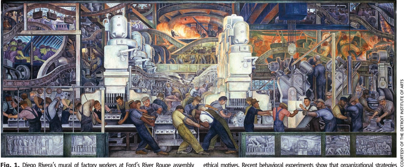
Fig. 1. Diego Rivera's mural of factory workers at Ford's River Rouge assembly plant (detail). Modern economies require cooperation toward common ends among countless individuals, often occurring as the result of both self-interested and

The other treatment precluded communication but simulated "government regulation." Withdrawals were not to exceed the announced